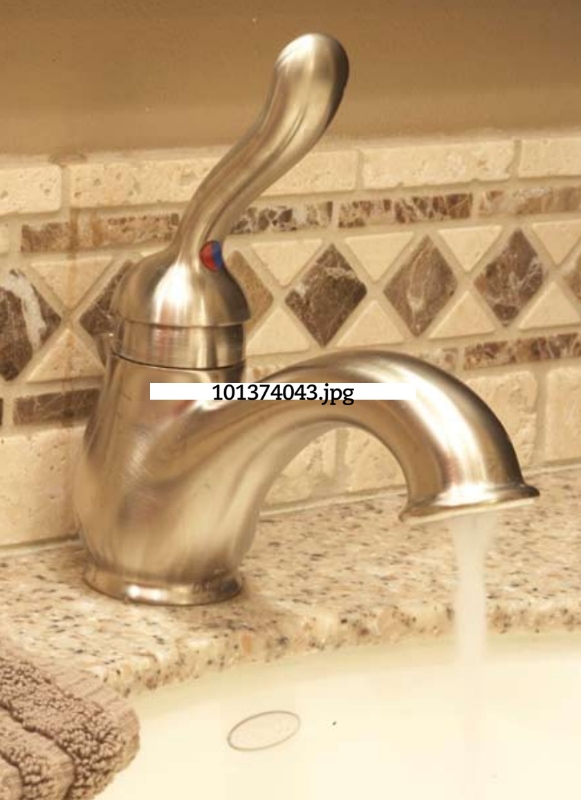
LEFT A petite, single-lever faucet tucks along the back of the countertop. The warm tones in the brushed nickel finish blend with the tile and solid-surfacing countertop.

oak,” Rose-Sprunk says. The distressed charcoal stain with red undertones gives a polished, custom look. Once they decided on the dark stain, the rest of the pieces—red accent wall, polished nickel hardware, black and taupe speckled solid-surfacing vanity top—just fell into place. “We didn’t want it to be too feminine since it was for the boys,” Lee says. “But it also had to be appropriate for guests, so it needed some elegance.”